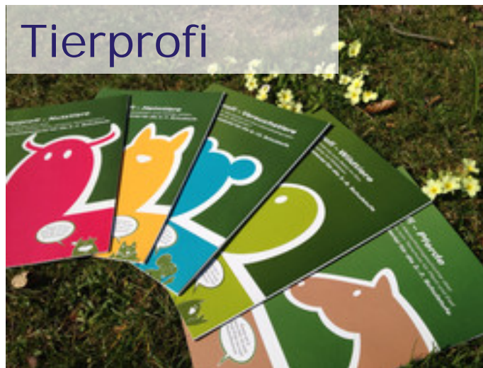
© Tierschutz macht Schule; teaching materials