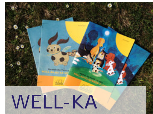
© Tierschutz macht Schule; teaching materials